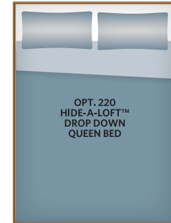
OPT. 220 HIDE-A-LOFT™ DROP DOWN QUEEN BED