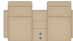
OPT. 194 78" THEATER SEATING