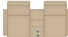
OPT. 194 78" THEATER SEATING