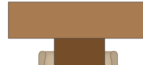
OPT. 833 FREE STANDING DINETTE W/ CRENZIA