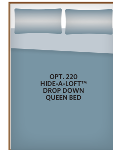
OPT. 220 HIDE-A-LOFT™ DROP DOWN QUEEN BED